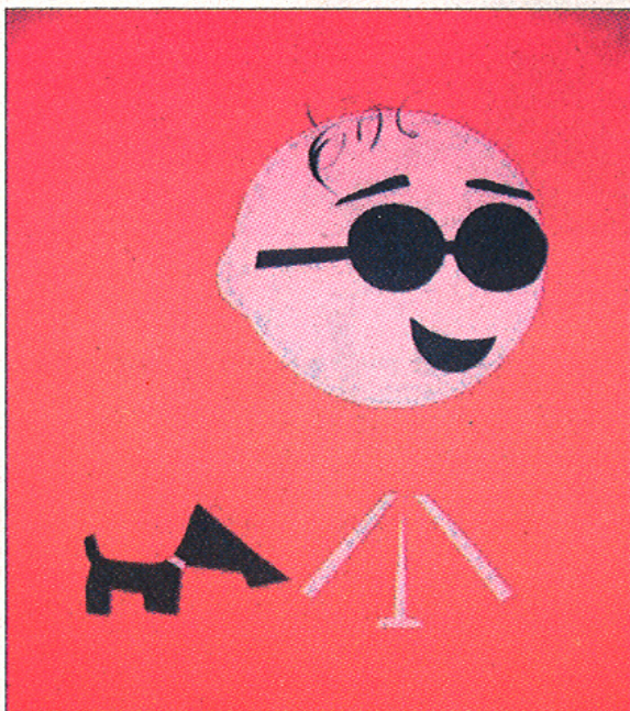
Dog and Boy